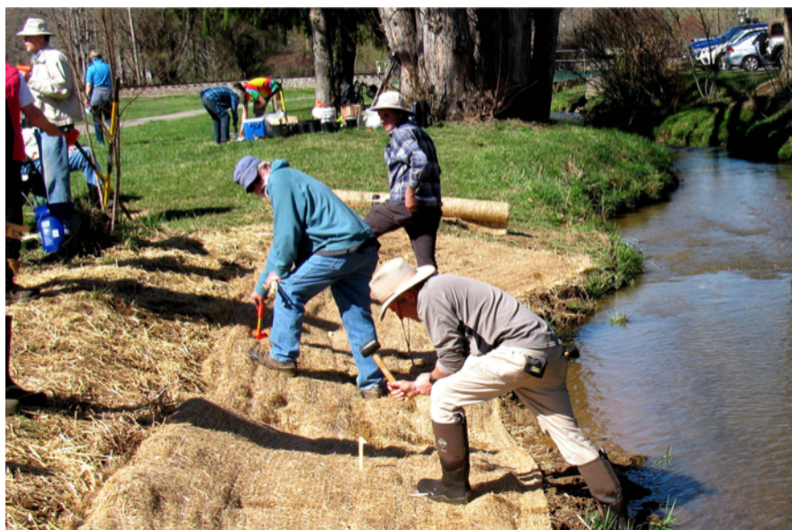
Participants at the Streambank Enhancement workshop helped scatter grass seed and pound live stakes into the streambank. The grass will emerge through the mulch during April, and the live stakes should be growing and leafing out by this summer.