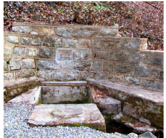
The picture at the right is the Pigeon Gap Watering Hole after Joey Rolland cleaned and restored the area