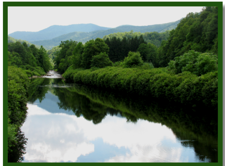
Thanks to the good stewardship efforts of local farmers, the highest level of water quality is maintained in the river and streams around Bethel.