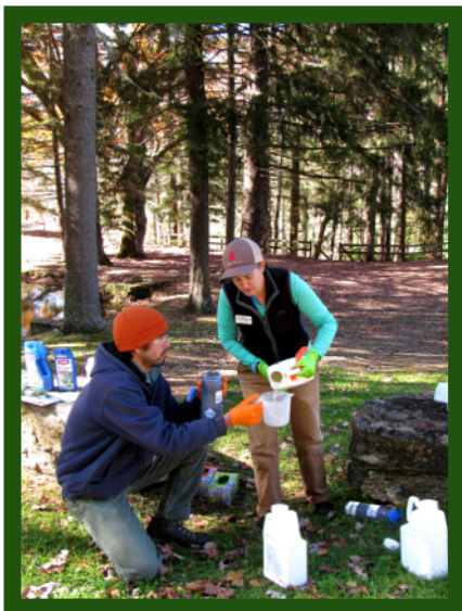
Instructors demonstrated the safe handling of chemicals during the Hemlock Restoration Workshop at Lake Logan on November 9th.

If a natural resource issue is identified that impacts landowners in the Bethel area, the Rural Preservation Committee can arrange for a workshop to be presented to convey the latest information about how to address the issue. On November 9, 2019, instructors from the Hemlock Restoration Initiative presented a BRCO-sponsored workshop at Lake Logan. The participants learned how to identify hemlock trees, how to assess the level of infestation of Hemlock Woolly Adelgid, and how to choose and safely apply chemical treatment. During the field session, participants treated hemlock trees on four different sites. Everyone enjoyed the training, and the Lake Logan staff was pleased to provide the conference space for free in return for getting their trees treated. (continued on page 3)