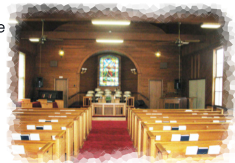
Historic Bethel Presbyterian Sanctuary