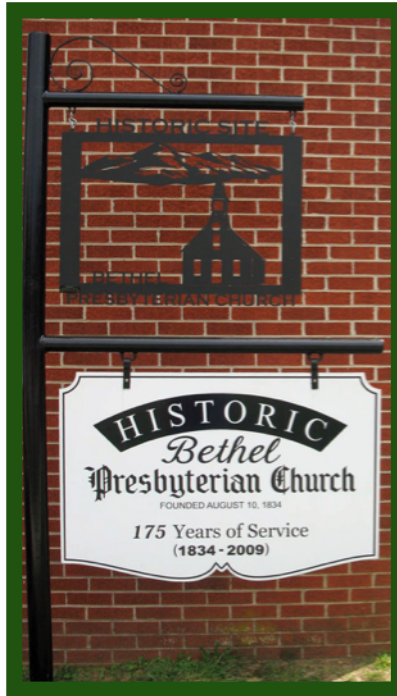
BETHEL PRESBYTERIAN CHURCH