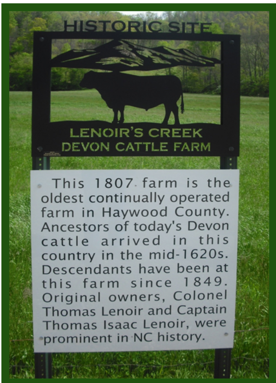
LENOIR'S CREEK FARM