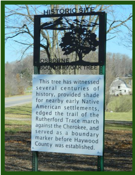
OSBORNE BOUNDARY OAK

In the February BRCO Newsletter, we highlighted the four State Historical Markers located in the Bethel community. Many people, places, and events that are of local importance are not eligible for the state signage program. To direct attention to notable local history, BRCO's Historic Preservation Committee developed its own marker project. To date, the committee has placed five local historic markers along roadsides in Bethel Community.