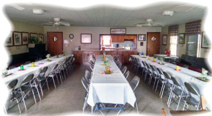
Dining Hall set up by the Beautification Committee for BRCO general meeting.