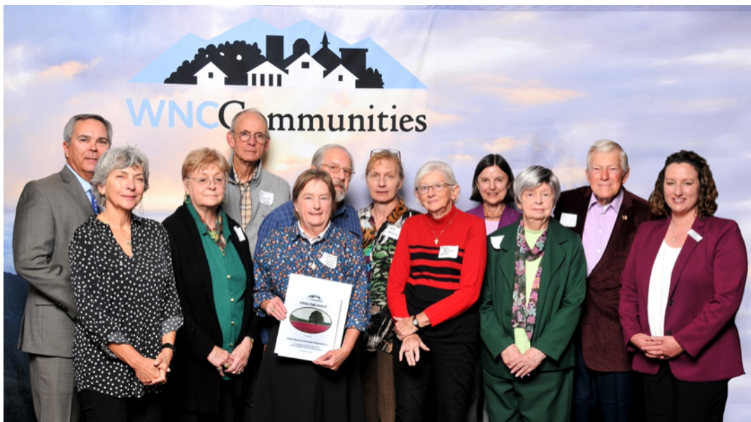
BRCO wins the White Oak Best in Class Award at the 74th Annual WNC Honors Awards.