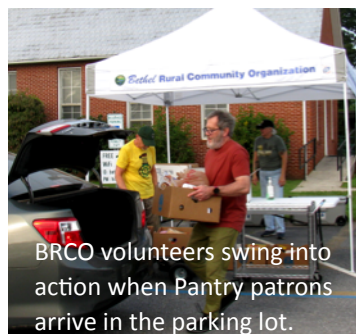
BRCO volunteers swing into action when Pantry patrons arrive in the parking lot.

After receiving the grant, BRCO utilized volunteers and local businesses to help implement the following improvements: renovating an interior room to accommodate more efficient storage of greater