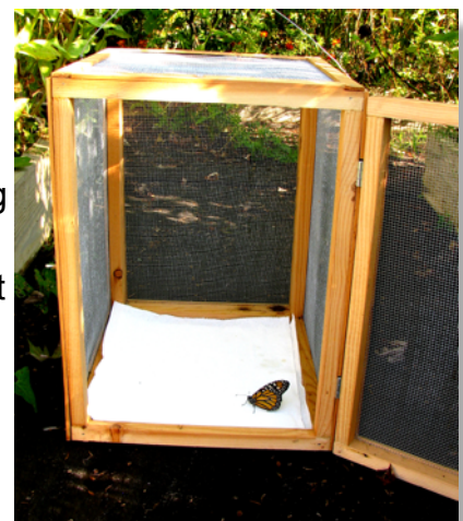
One of the butterfly cages built by the Bethel Middle School FFA students.