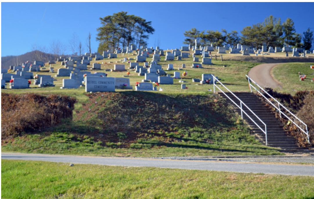
Bethel Community Cemetery