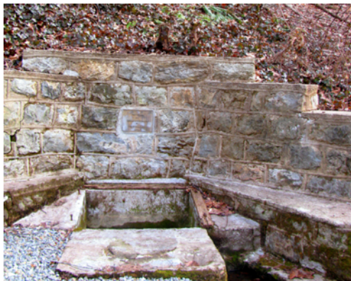
Pigeon Gap Water Hole after restoration in 2013.

The fellowship hall is much improved in appearance with the Beautification Committee rearrangement of the Historic Preservation art prints so that all twenty-six are now on display. Several had been stored in the closet for years while we decided how to configure them. We have determined that with further rearrangement in the hallway, we should be able to collect twelve more prints. The art print collection includes either paintings or reproductions of original photographs or paintings of the following historic Bethel subjects: bird, bridge, cabin, churches, farms, houses, logging map, mill, patent drawing, portrait, post office/train station depot, schools, store, tree. The North Carolina Society of Historians awarded the Historic Preservation Committee's art print collection with the Multi-Media Award as well as one of the top five awards (Lighthouse Award) in 2020.