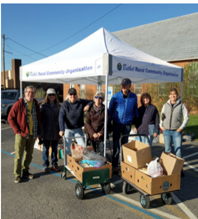
Left: New canopy for use by the Food Pantry with BRCO's name and logo.