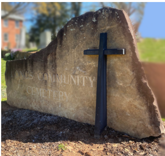
The stone marker designating the cemetery entrance is a commissioned, hand-carved sign.

Hand-written deeds, many lost, dictate ownership of the original burial sites in the older portion of the cemetery. A separate 501(c)(3) cemetery committee, established in the early 1970s, oversees plot purchase and mowing of the new sections of the cemetery but also provides upkeep on the original cemetery grounds. Older sections of the burial area include hand-carved markers made by travelling stonecutters, substantial river rock masonry stones, obelisks, affluent monuments, ledgers, and modern granite stones. The newer cemetery allows for ledger markers only to allow for easier upkeep.