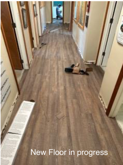
New Floor in progress