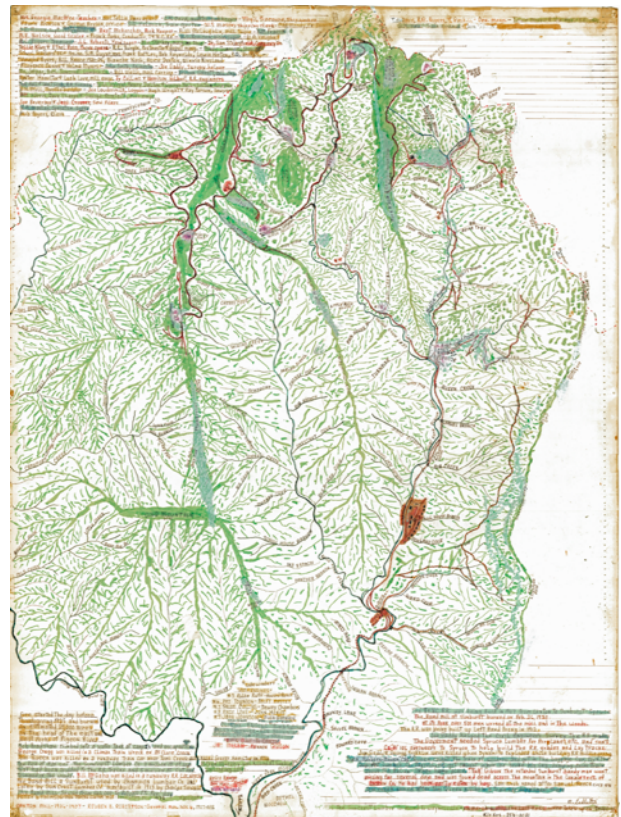
Below: Sunburst Map drawn by Mack Ledbetter