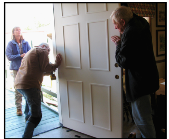
After much preparation, the door was installed and ready for the finishing touches.