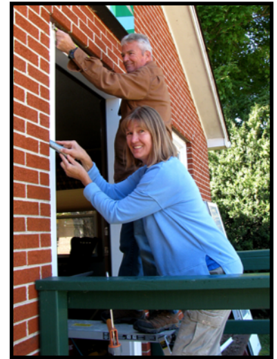
The outer frame of the entrance had to be re-worked to fit the dimensions of the door.